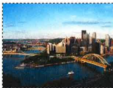
Carbon Storage Program Infrastructure Review Meeting November 15-17, 2011 Sheraton Station Square Hotel Pittsburgh, Pennsylvania