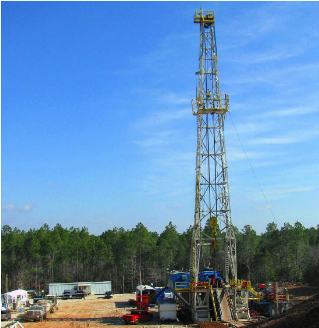
Figure 3. D-9-8#2, Characterization Well Drilling